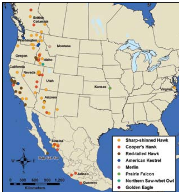
Locations of band encounters from raptors banded on the Boise Ridge, 1993-2009 (IBO 2009 annual Report).

U.S. used by migratory raptors. It was found that generally, raptors banded from the Cascade mountains west, stay west of the Cascades. Raptors banded at Intermountain sites such as the Boise Ridge generally stay within the intermountain region, between the Cascades and the Rockies. Raptors banded within or east of the Rocky Mountains generally stay to the east.