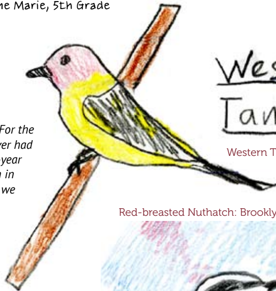
Western Tanager: Maddie B.